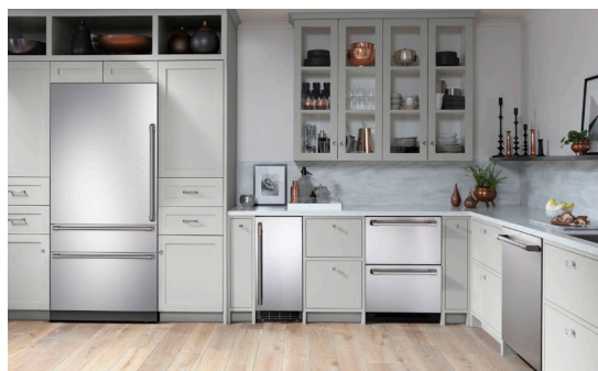
The Monogram® fully-integrated bottom freezer offers a professional style stainless steel finish to complete any luxury kitchen design.

In 2022, the Selmer manufacturing plant received national attention again for another historic first—the successful completion of a pilot of a fully electric, autonomous heavy-duty vehicle on U.S. public roads without a driver on board. Approval of the pilot with Einride, a global technology leader in EV and autonomous freight vehicles, was secured from the National Highway Traffic Safety Administration (NHTSA). The Einride autonomous vehicle is now supporting real-time workflows, transporting goods daily from the factory floor to the plant's warehouse, using McNairy County public roads.