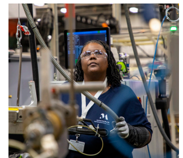
A Monogram employee works on the VTAC line in Selmer, TN.