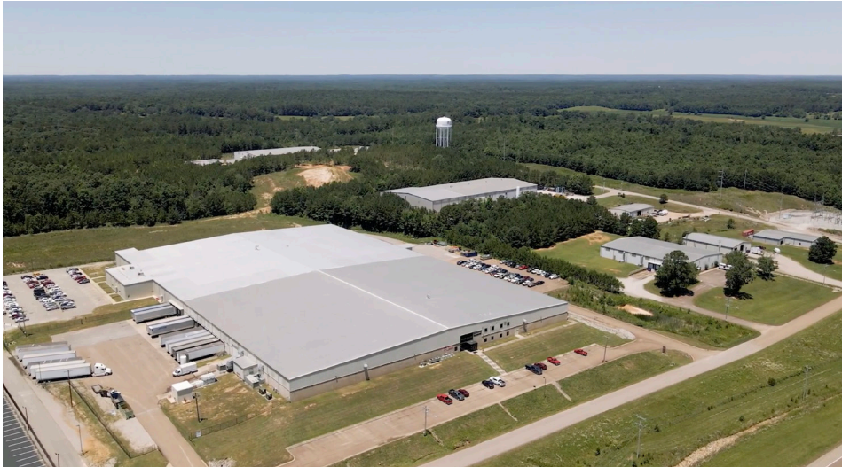
GE Appliances Monogram Refrigeration, LLC Plant in Selmer, TN.

GE Appliances continues to grow and thrive in Tennessee with Monogram Refrigeration, LLC , a wholly owned subsidiary located in McNairy County that manufactures high-end Monogram®, Cafe™ and GE Profile™ refrigerators and freezers and Zoneline® air conditioners. Most recently, the plant completed a multi-million-dollar investment for Zoneline® production to use a new refrigerant, R454B.